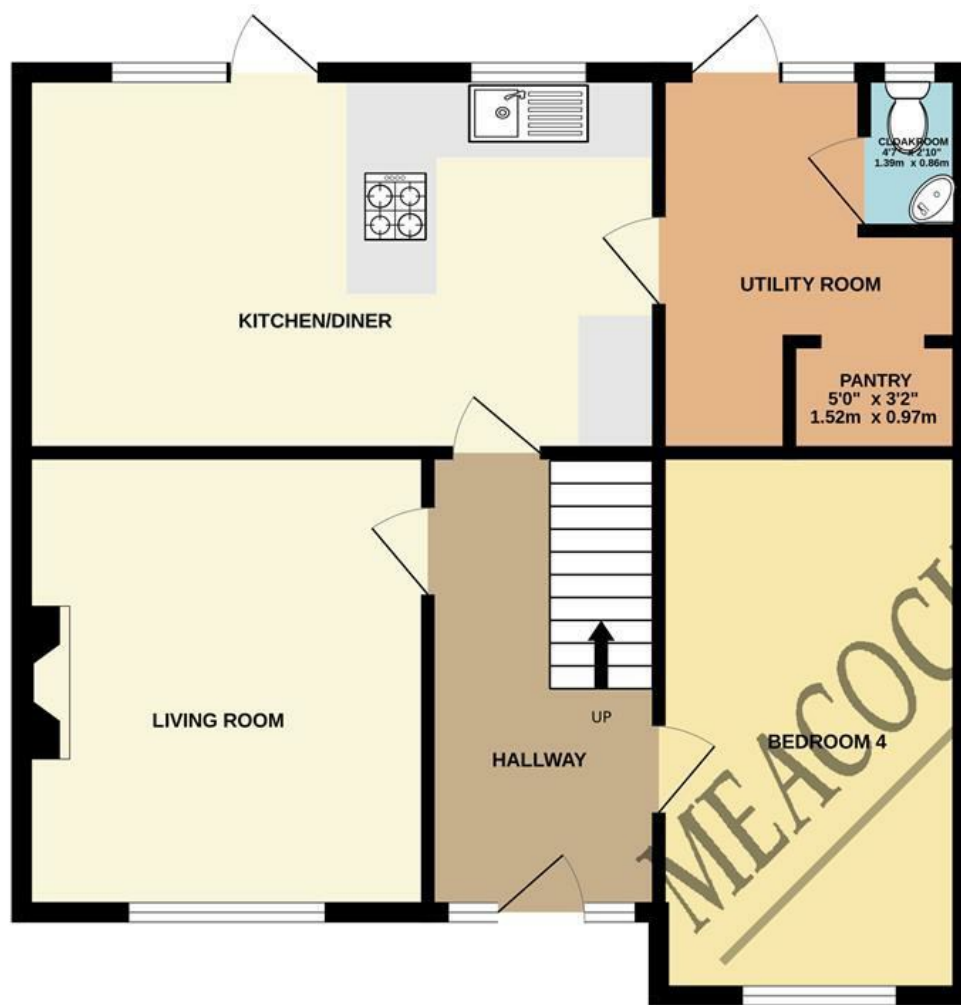
GROUND FLOOR 670 sq.ft. (62.3 sq.m.) approx.